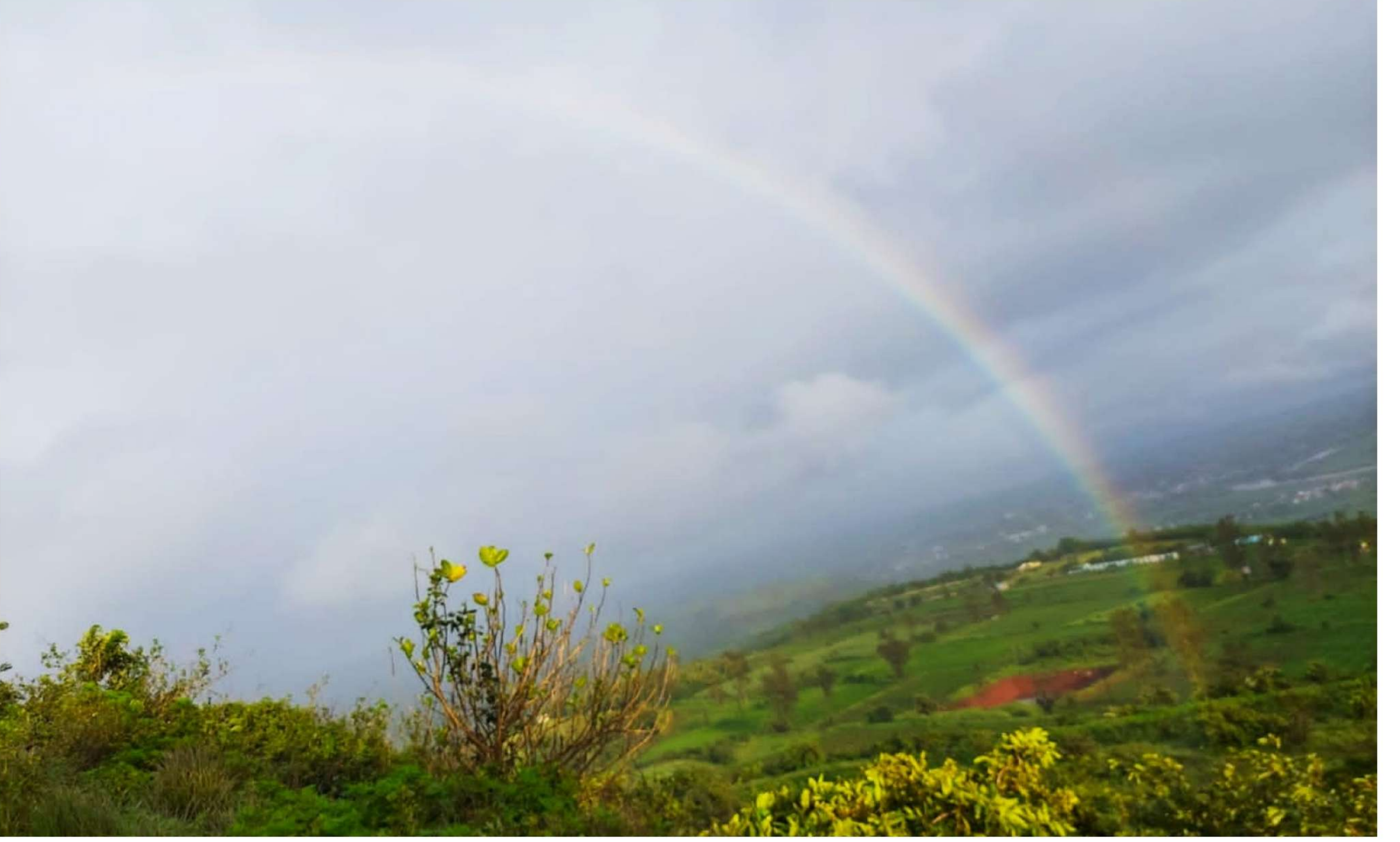
RTN. ELA MATE