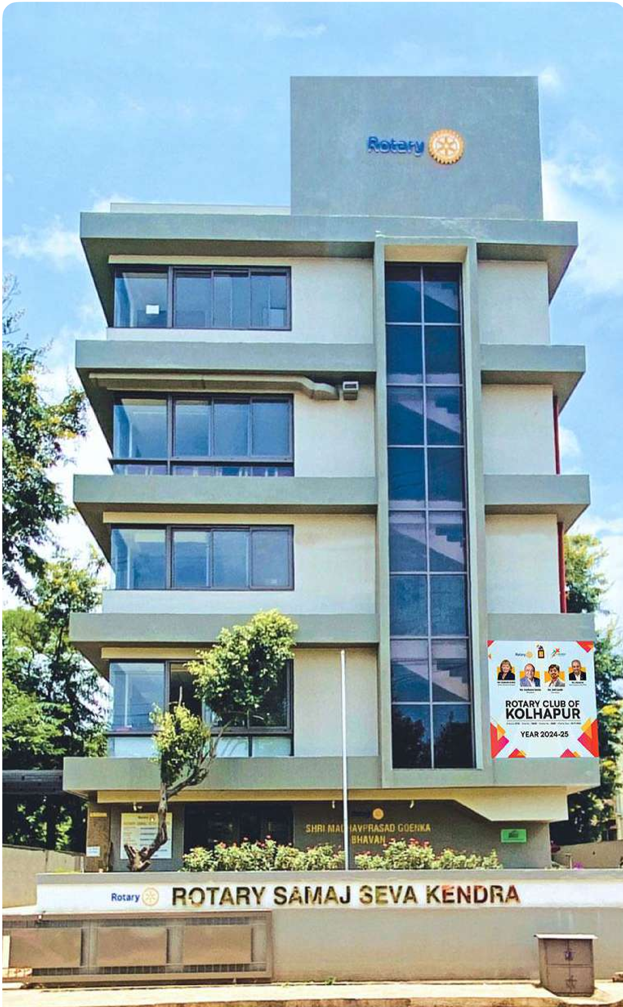
ROTARY CLUB OF KOLHAPUR'S ROTARY SAMAJ SEVA KENDRA BUILDING